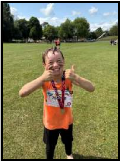
Well done to this lovely boy for taking part in the 5k tough mudder event for the race for life charity to raise money for Cancer research.

The children's out of school achievements this week. Keep them coming. What they do and learn out of school is as important as what they do here.