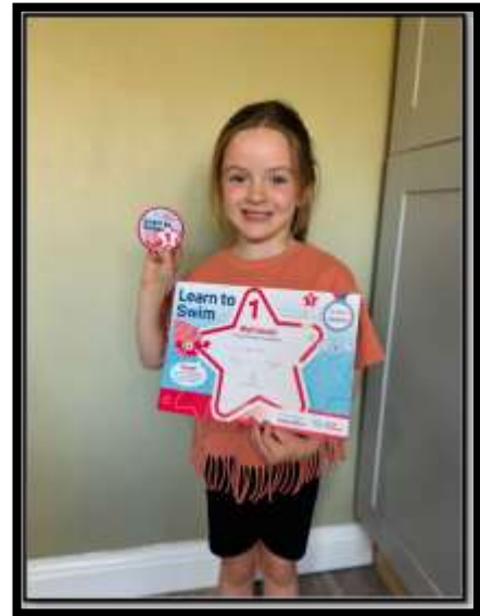
This delightful girl got her very first swimming certificate.