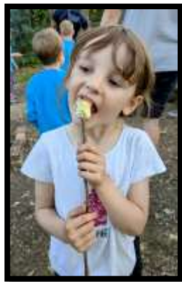
Lots of fun and learning at Beavers this week – fire lighting, den building, bug hunting and toasting marshmallows!