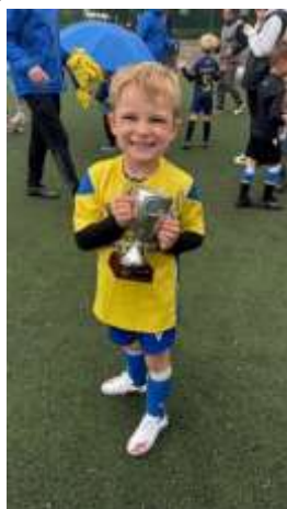
Man of the Match for his team last weekend!