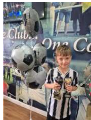
Managers player award from Penistone Church U7 presentation day!