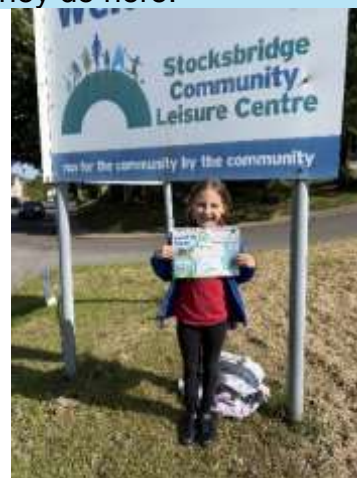
Well done to this lovely girl who has passed her stage 4 in swimming and moved up to stage 5!