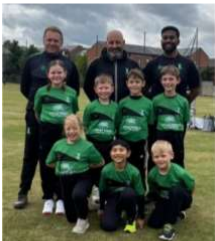
Last weekend one of our remarkable Y2 boys played his first ever cricket match. He's loving it!