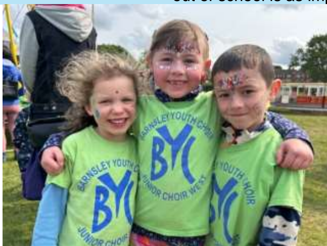
These three friends had a great time singing for Barnsley Youth Choir at the Penistone Gala.

The children's out of school achievements this week. Keep them coming. What they do and learn out of school is as important as what they do here.