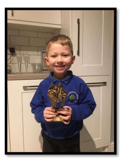
This young man won trainer of the month in December at cricket and here he is with his trophy. Well done!

The children's out of school achievements this week. Keep them coming. What they do and learn out of school is as important as what they do here. Email items for the newsletter to <u>Newsletter@stocksbridge-nur.sheffield.sch.uk</u>