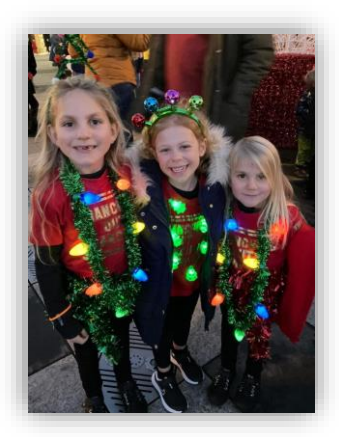
A trio of Christmas dancers.