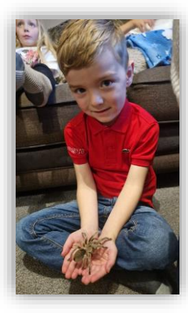
A different creature was held by this little boy.