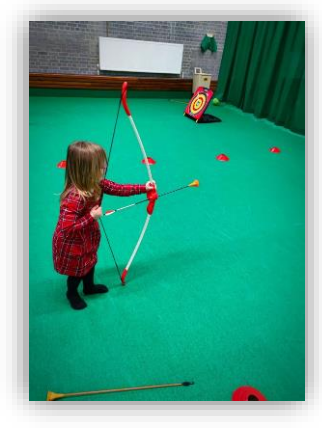
Someone in Nursery tried their hand at archery last weekend.