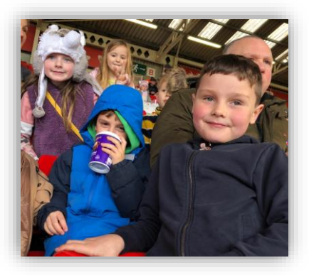
The children who went off to watch the Sheffield United Women's football last Saturday enjoyed their free day out!

A busy weekend for this young lady collecting a cheque from the Mayor of Stocksbridge. She has also been awarded the bronze award for all the work she had done supporting the community, completing her challenges. What a star!