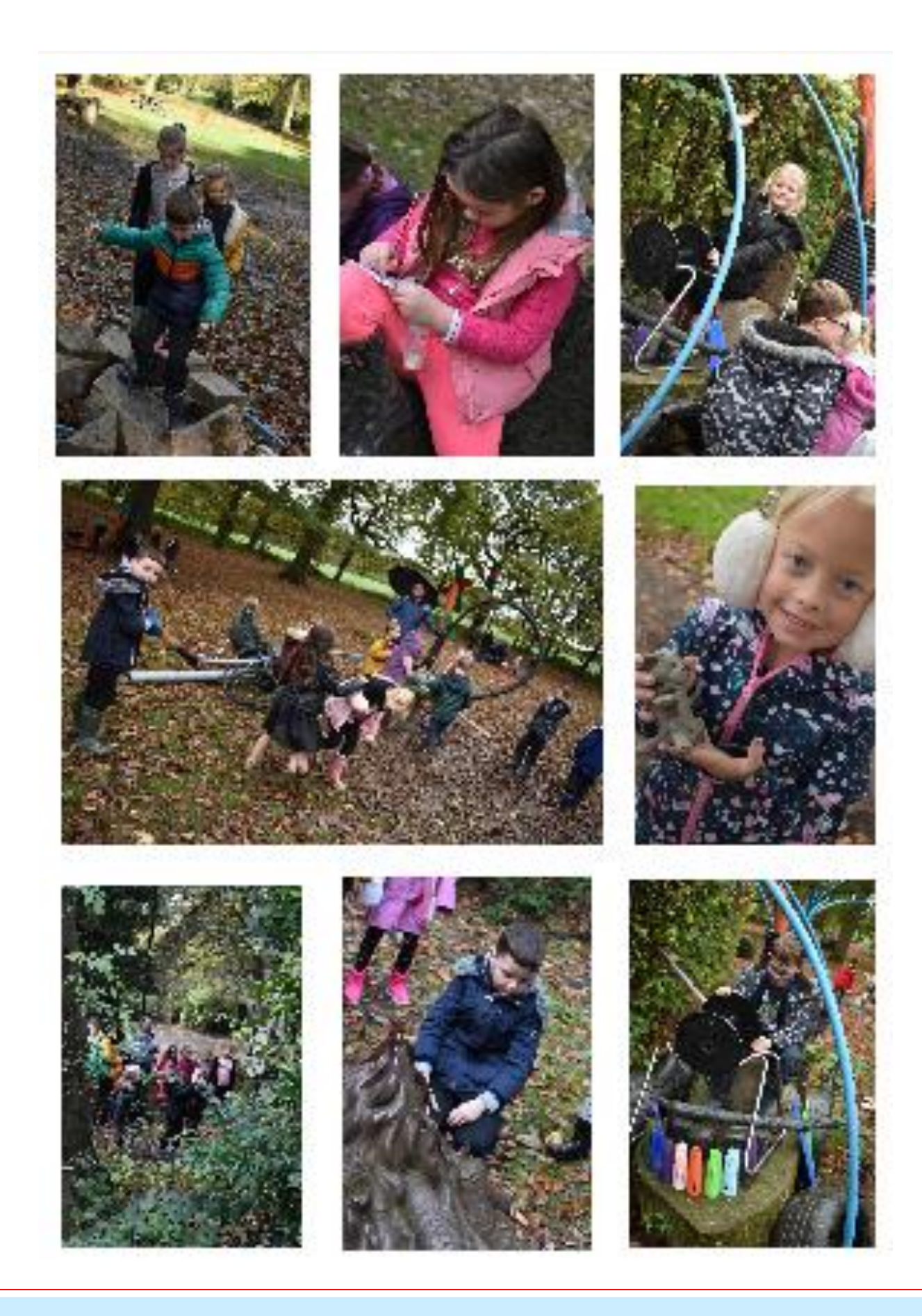
Assembly Theme: Keeping Safe