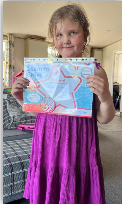
This lovely young girl has achieved her second swimming certificate. Great stuff!