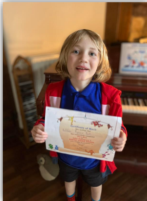
This lovely fellow has finished his first piano book!

Tweak of the Week: Show respect to adults by doing as they ask, first time.