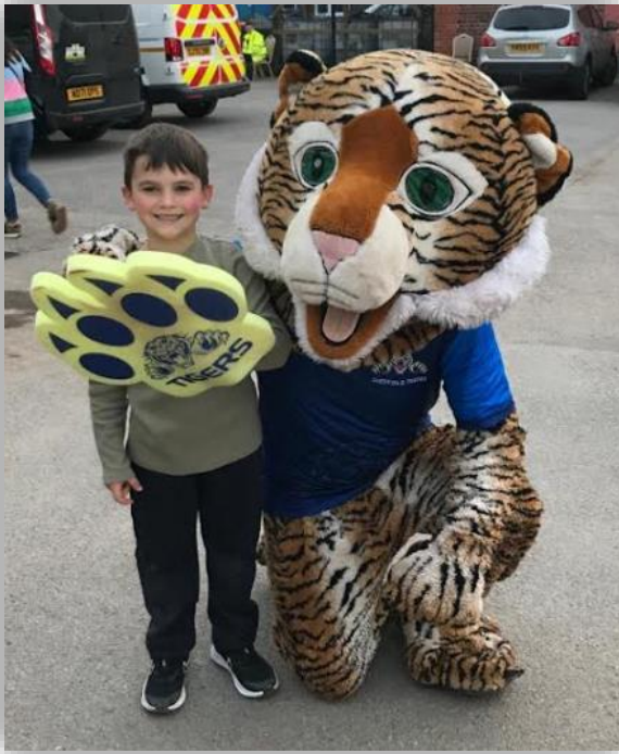
This young man has been desperate to share his first experience of the speedway watching the Tigers. He has such different hobbies!

The children's out of school achievements this week. The children love sharing these in assembly so please keep sending them in. They say they feel proud in front of their friends.